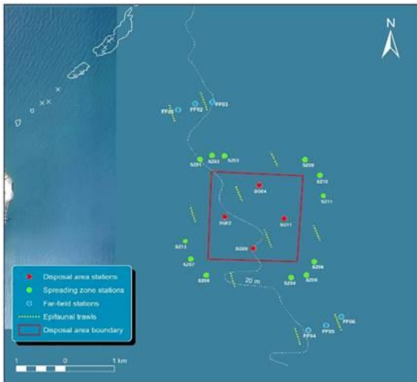
Ongoing annual benthic sampling at Offshore Disposal Area. Updated Benthic Sampling requirements for ongoing sampling (yearly).