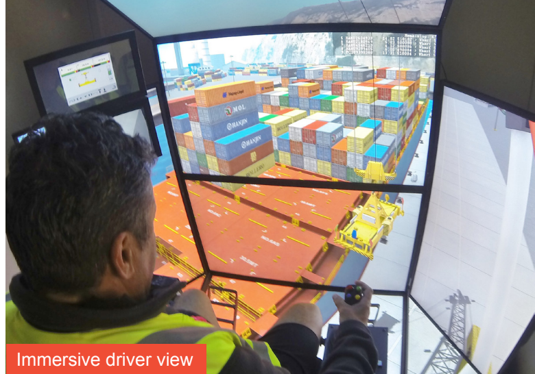
Immersive driver view