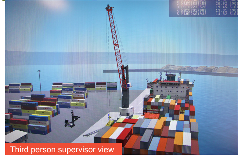
Third person supervisor view